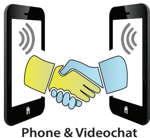
Phone & Videochat