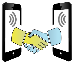
Phone & Videochat