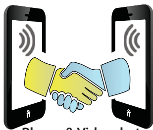
Phone & Videochat or Face-to-Face