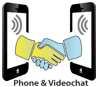
Phone & Videochat