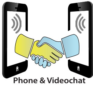
Phone & Videochat