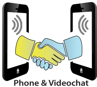
Phone & Videochat