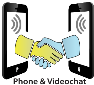
Phone & Videochat