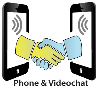
Phone & Videochat