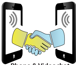
Phone & Videochat or Face-to-Face