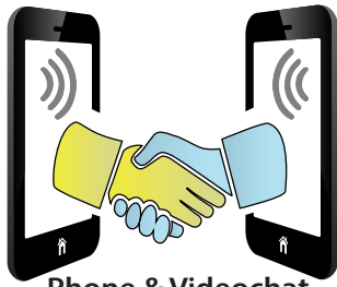
Phone & Videochat or Face-to-Face