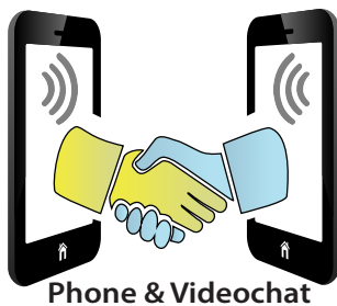
Phone & Videochat