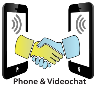
Phone & Videochat